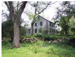
Farmhouse Staff Offices